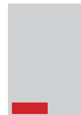
Sixteenth Page (landscape) 94mm x 31.75mm £110

Prices are per issue and exclusive of VAT. Discounts are available for block bookings.