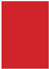
Full Page 210mm x 297mm (plus 5mm bleed) £1200