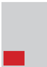
Eighth Page (landscape) 94mm x 66.5mm £200