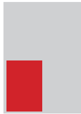
Quarter Page (portrait) 94mm x 136mm £350