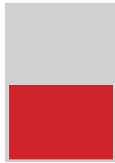
Half Page (landscape) 192mm x 136mm £630