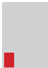
Sixteenth Page (portrait) 45mm x 66.5mm £110